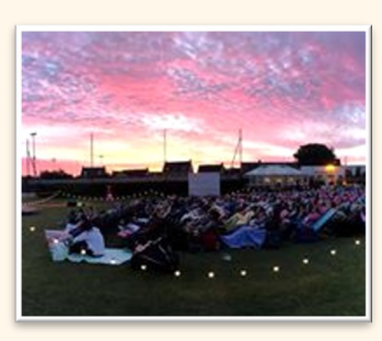
Enchanted Cinema, 2018