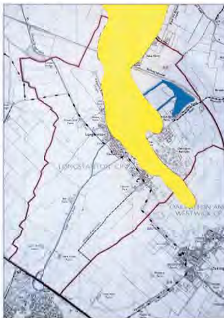
Map of Longstanton Parish boundary (red) illustrates the approximate location of this gravel bed, (yellow) and importantly the large ditches (blue) that have been cut, apparently, to drain water from the gravel bed to the balancing ponds.

affect All Saints' and St Michael's end of the village on higher ground away from the poorly maintained Longstanton brook and its clogged conduits.