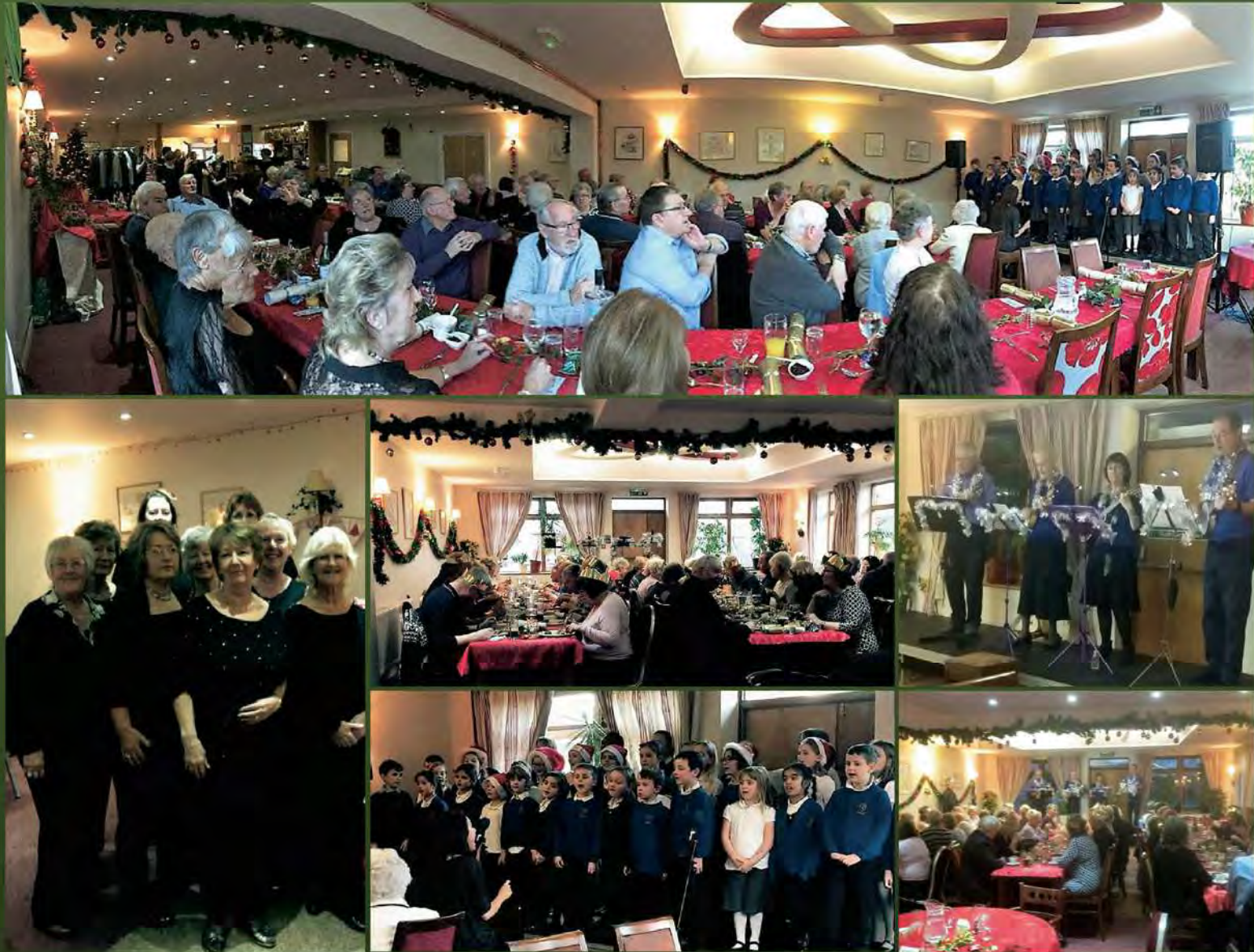
Over 60s Christmas Lunch in the Black Bull, December 2015.

In this issue: Christmas lights switch on, Longstanton Floods Group, Letters to the Editor, plus other regular features including: Sports News, Community Concerns, Memory Lane, LDHS Update, Surgery Update, etc.