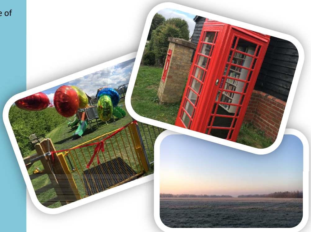
Playground opening Easter 2015, St Michaels Book Swap and Field behind Stokes Close

Parish Councillors are expected to serve on a variety of committees or working groups including: Finance Committee, Employment Committee, Standards Committee, Village Events Working Group and represent various interests including Home Farm, Northstowe, Paths/Footpaths, etc. In addition, the Parish Council is sole trustee of the Village Institute and the Gravel Pit Charities.