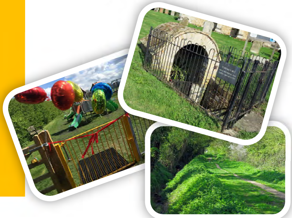
Playground opening Easter 2015, St Michaels Well and Long Lane

Parish Councillors are expected to serve on a variety of committees or working groups including: Finance Committee, Employment Committee, Pavilion & Recreation Ground Committee, Standards Committee, Village Events Working Group and represent various interests including Home Farm, Northstowe, Paths/Footpaths, etc. In addition, the Parish Council is sole trustee of the Village Institute and the Gravel Pit Charities.