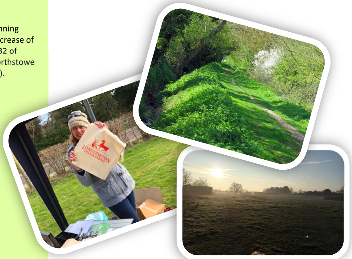
Long Lane, Longstanton Village Market and sunrise on Manor Field

Parish Councillors are expected to serve on a variety of committees or working groups including: Finance Committee, Employment Committee, Standards Committee, Village Events Working Group and represent various interests including Home Farm, Northstowe, Paths/Footpaths, etc. In addition, the Parish Council is sole trustee of the Village Institute, Gravel Pit and Recreation Ground (dormant) Charities.