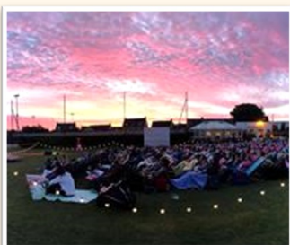
Enchanted Cinema, 2018